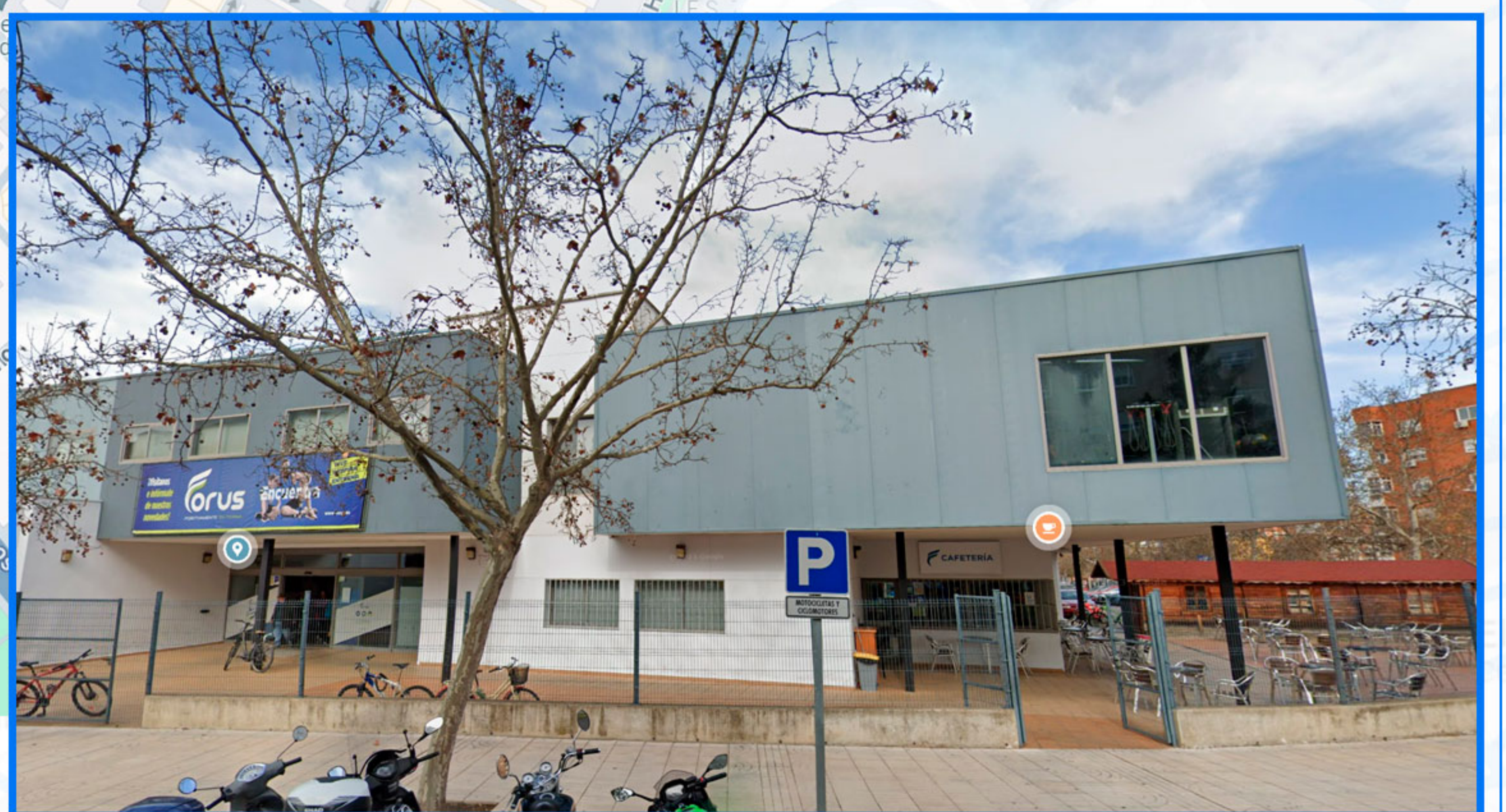
Av. Jose María Alcaraz y Alenda, 6, 06011 Badajoz

Click on picture for watching virtual map