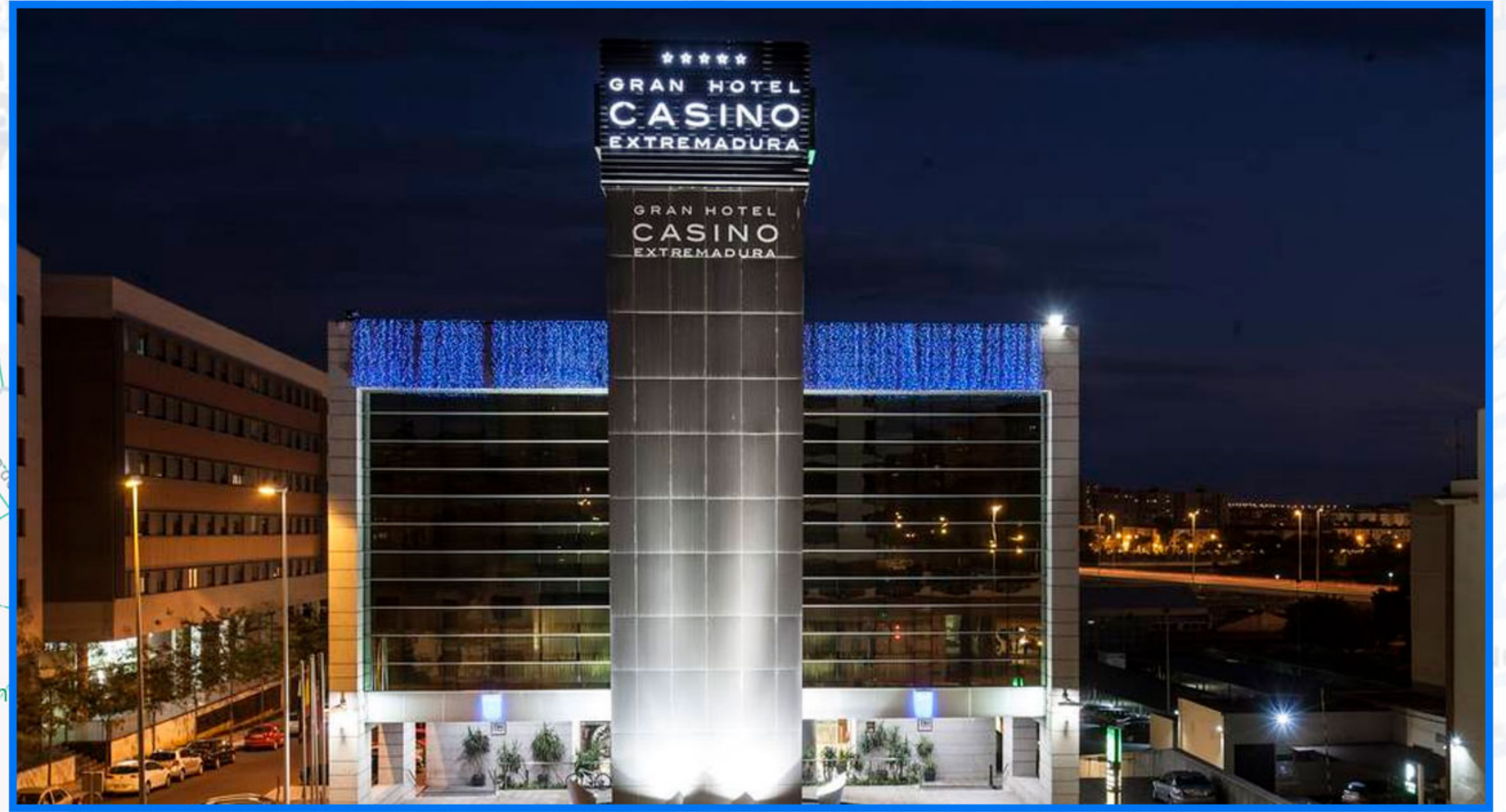
Av. Adolfo Díaz Ambrona, 11, 06006 Badajoz